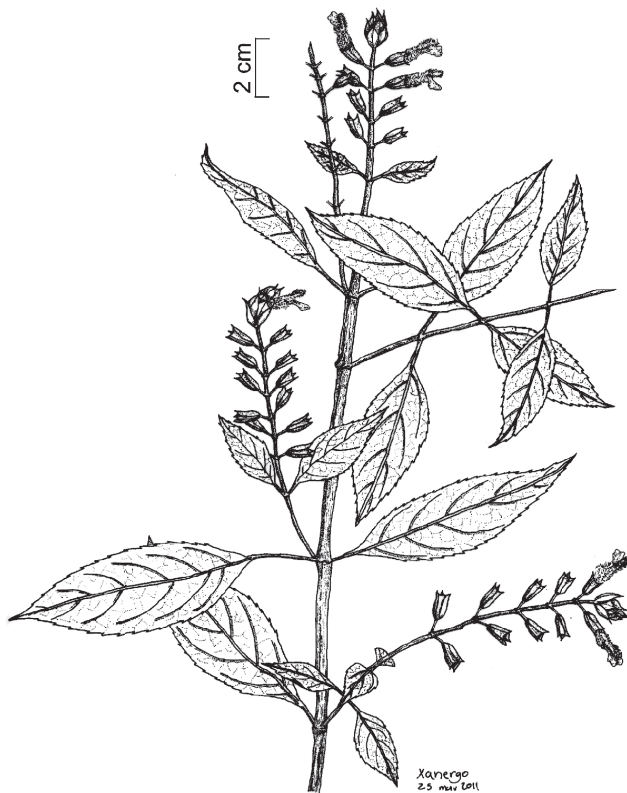
Figure 1. Salvia cacomensis J. G. González, J. Morales et J. Rodríguez. General appearance (drawn from the holotype).

pink magenta in S. cacomensis ) and the invagination at the base of the corolla tube. However, there is a member of Briquetia which does not present invaginated corollas at the base, S. ecuadorensis Briq; and other one, which very rarely can exhibit magenta corollas, S. mexicana L. S. cacomensis differs from the rest of the species of section Briquetia because of its 2-flowered verticillasters (vs. 3-12-flowered), magenta or magenta-pink corollas (vs. purple ones), the length of the calyx (7-13 mm vs.