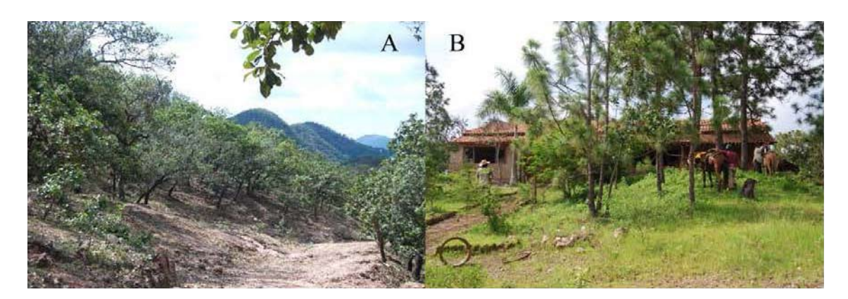
Figure 1. Cerro del Pirame, La Guásima, Concordia: A, mesa covered by oak forest; B, stand of pine trees ( Pinus oocarpa ) where the 2 live specimens of Crotalus stejnegeri were found.

Based on our current knowledge, all 3 species of longtailed rattlesnakes occupy small geographic areas, although