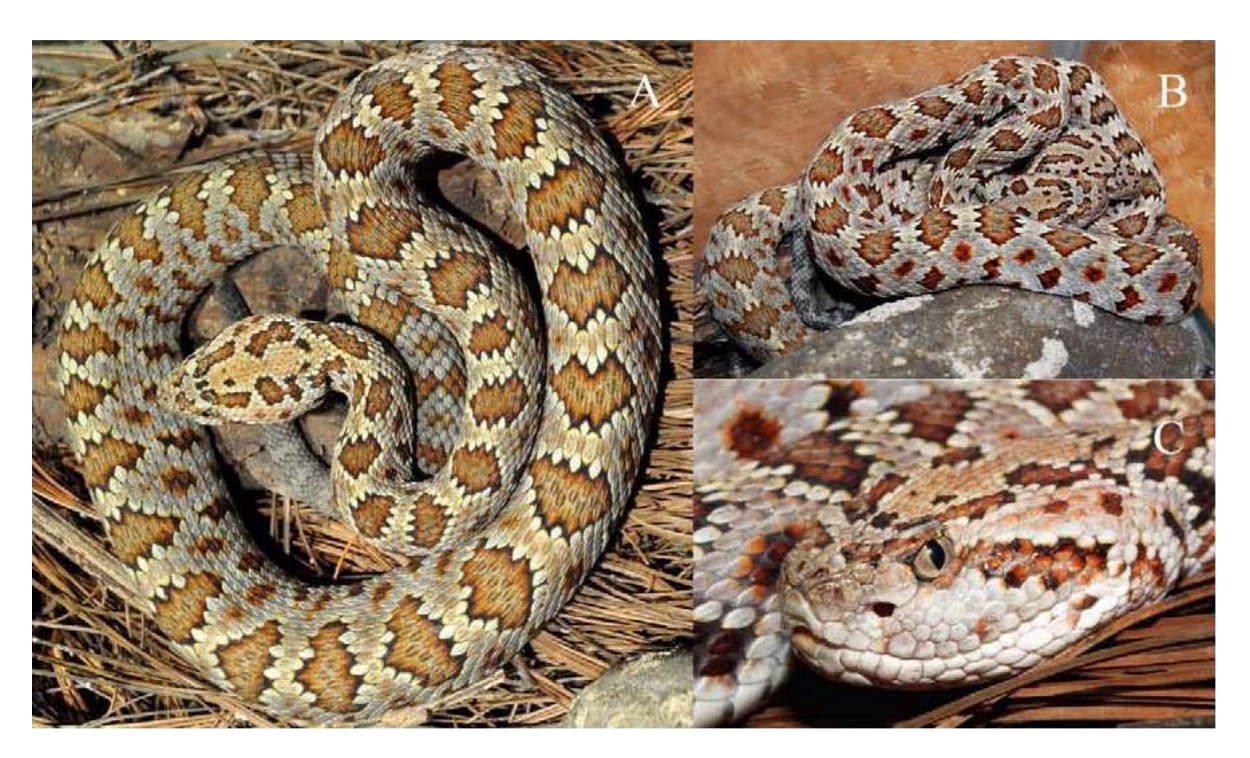
Figure 2. Crotalus stejnegeri: live female, 79.0 cm TL, from Cerro del Pirame, La Guásima, Concordia, Sinaloa: A, specimen in toto; B, orange-brown coloration after shedding skin; C, laterodorsal view of head showing 6 prefoveals.

Reves-Velasco et al. (2010) suggest that their ranges must be far greater than presently understood. These authors offer several explanations in support of their statement, including the presence of illegal narcotics activity and the scarcity of accessible roads, which are nearly impossible to use during the rainy season. They also list anthropogenic factors potentially affecting the habitat of C. lannomi such as agriculture, cattle grazing, logging, and mining. All of the above explanations and factors are also applicable to the tropical dry forests covering the southern highlands of Sinaloa, and we feel that the presence of C. stejnegeri in southern Sinaloa and the neighboring states of Durango and Nayarit is probably greatly underestimated. It should be pointed out that many of the comuneros of La Guásima are familiar with this peculiar species of rattlesnake which they call "víbora sorda", and it is considered a secretive, rarely observed species that does not grow very large (less than 1 m long).