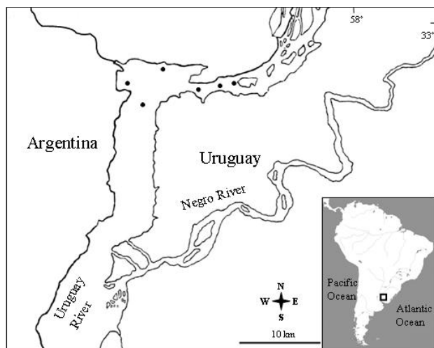
Figure 1. Map of the study area in the Lower Uruguay River, Argentina, South America. • sampling sites at the main river course, bays and banks.

Specimens were collected seasonally between November 2007 and March 2009 in the lower Uruguay River. During the study were conducted 5 samplings in an area located at 33° 5' S - 58° 12' W, 33° 5.9' S - 58° 25' W, covering the main channel, the bays, and the reed beds along the banks of the river (Fig. 1). The material was collected with van Veen dredges and fixed in situ with 5% formalin.