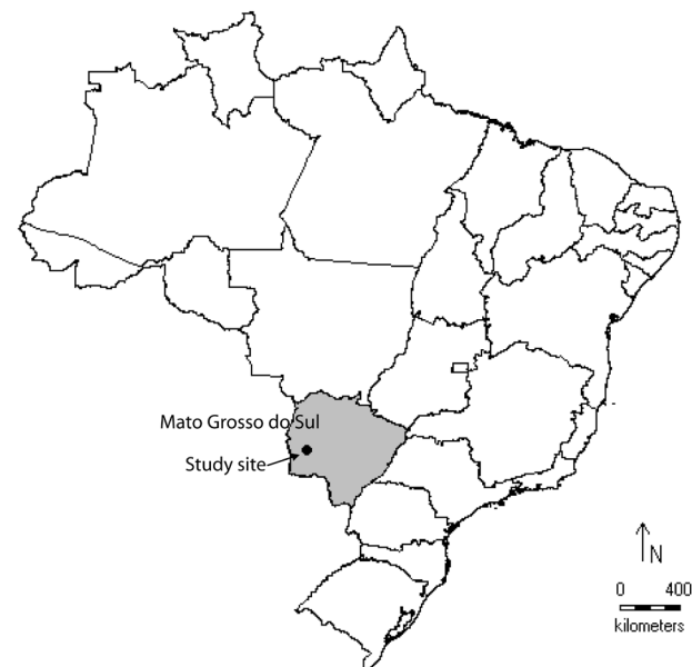
Figure 1. Study site localization, Parque Nacional da Serra da Bodoquena, Mato Grosso do Sul, Brazil.

We identified prey items to order level, under a stereoscopic microscope, using Borror and DeLong (1988) as reference. All larvae were considered a single resource; spiders and scorpions were grouped in Arachnidae. We calculated numeric and volumetric percentages of the food items. We estimated volume by the parallelepiped formula using a millimetered plaque (Hellawell and Abel, 1971). For each stomach sample, we grouped all items of the same category and used the total volume. For example, in each stomach, all the formicids were combined and the total volume was