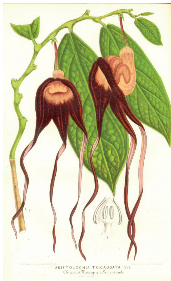
Figure 2. Illustration of A. tricaudata from Lemaire (1867).

Shrub up to 3-4 m high; branches zigzag with slightly swollen nodes; leaves simple, alternate, petiole 1-2 cm long, tomentulose; lamina 10-23 cm long, 5-12 cm wide,