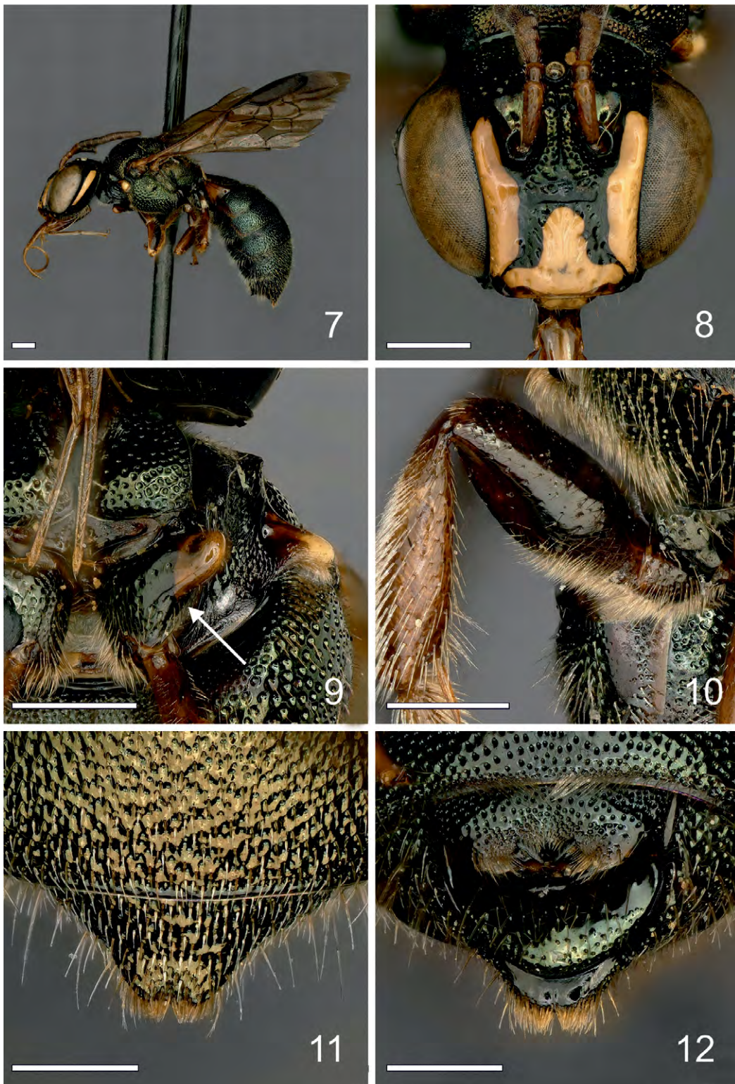
Figures 7-12. Ceratina macondiana sp. nov. male. 7, Habitus, lateral view; 8, habitus, frontal view; 9, forecoxa, ventral view; lateral projection yellowish; 10, hind trochanter and femur; 11, T6 median projection, dorsal view; 12, T7 and T6 median projection, ventral view.