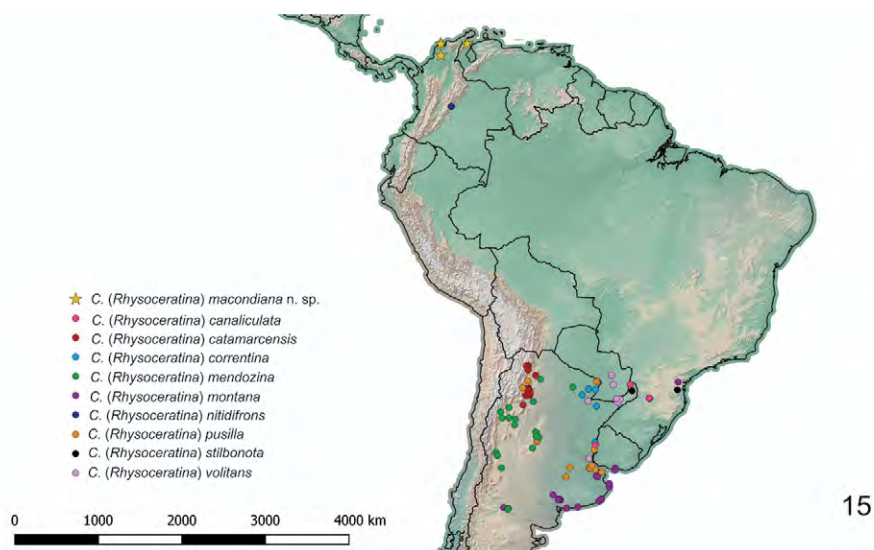
Figure 15. Ceratina (Rhysoceratina) distribution map. Northern species C. (R.) nitidifrons and C. (R.) macondiana sp. nov., show a disjunct distribution from the other species of the subgenus.