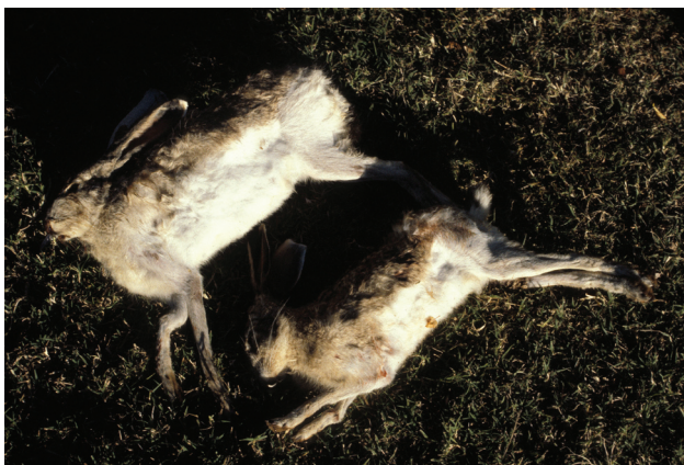
Figure 1. Photo of a pair of Lepus callotis gaillardi killed by a vehicle in New Mexico, USA. The larger specimen is a female.

Using Google Scholar, we reviewed scientific literature about L. callotis , abstracted pertinent information, and plotted collection locales on Google Earth. Collection locations for 281 specimens of L. callotis were obtained from databases in the Mammal Networked Information System (MaNIS; http://www.manisnet.org ) and the