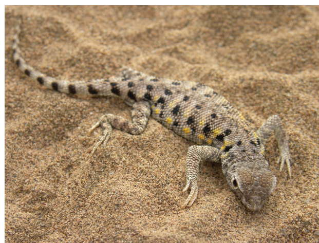
Figure 1. The neotype specimen collected in Tarapaca region, Chile.

east of Iquique (20°14'23.5" S; 69°59'32" W), in sandy environments with rocks of different sizes, and the presence the Tillandsia spp. The climate is extremely dry, with the presence of small beetles and scorpions. Three adult lizards were collected in January 12, 2011, by Margarita Ruiz de Gamboa, Marcos Ferrú and Pablo Valladares, and deposited in the Colección Zoológica de Zonas Áridas y Andinas (CZZA 0300, 0301, 0302) at the University of Tarapacá, Chile. The neotype (CZZA 0300; Fig. 1) was compared with other species from the L. montanus group ( sensu Etheridge, 1995; Schulte et al., 2000). Specimens were measured (Table 1) and compared with other “phrynosaurian” lizards from northern Chile (Table 2).