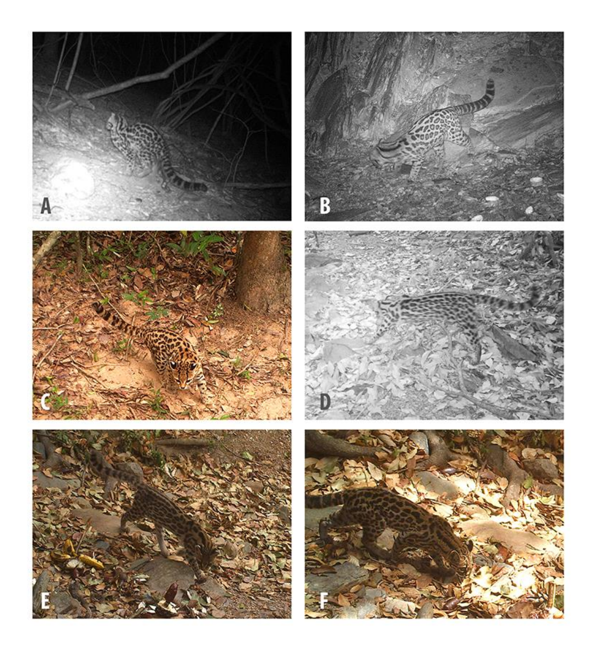
Figure 1. The first records of margay ( Leopardus wiedii ) in the open caatinga semi-arid thorny scrub (A) and in the dry deciduous forests (B, C, D, E, F) of the Caatinga domain in northeast Brazil.