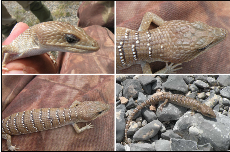
Figure 1. Specimen of Gerrhonothus lugoi from Nuevo León, Mexico.

vs. 14), longitudinal ventral scale rows (14 vs. 12), suboculars (3 vs. 2), and primary temporals (5 vs. 4) (Bryson & Graham, 2010; McCoy, 1970).