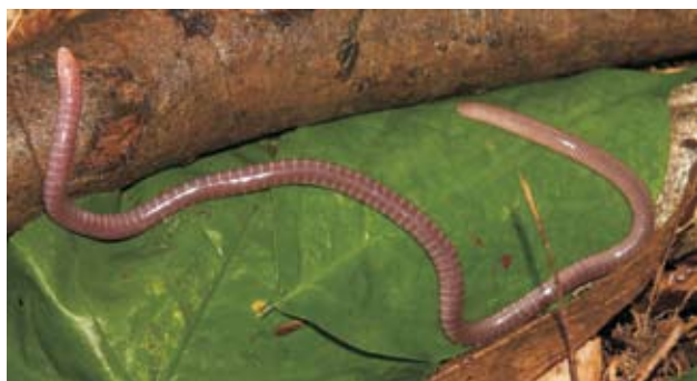
Figure 2. Specimen CNAR-IBH 26015, first finding of the caecilian Gymnopsis syntrema in Mexico from Ruinas at the Montes Azules Biosphere Reserve, Municipality of Ocosingo, Chiapas, southern Mexico (16°06'35.21" N, 91°00'59.10" W; 300 m elev.).