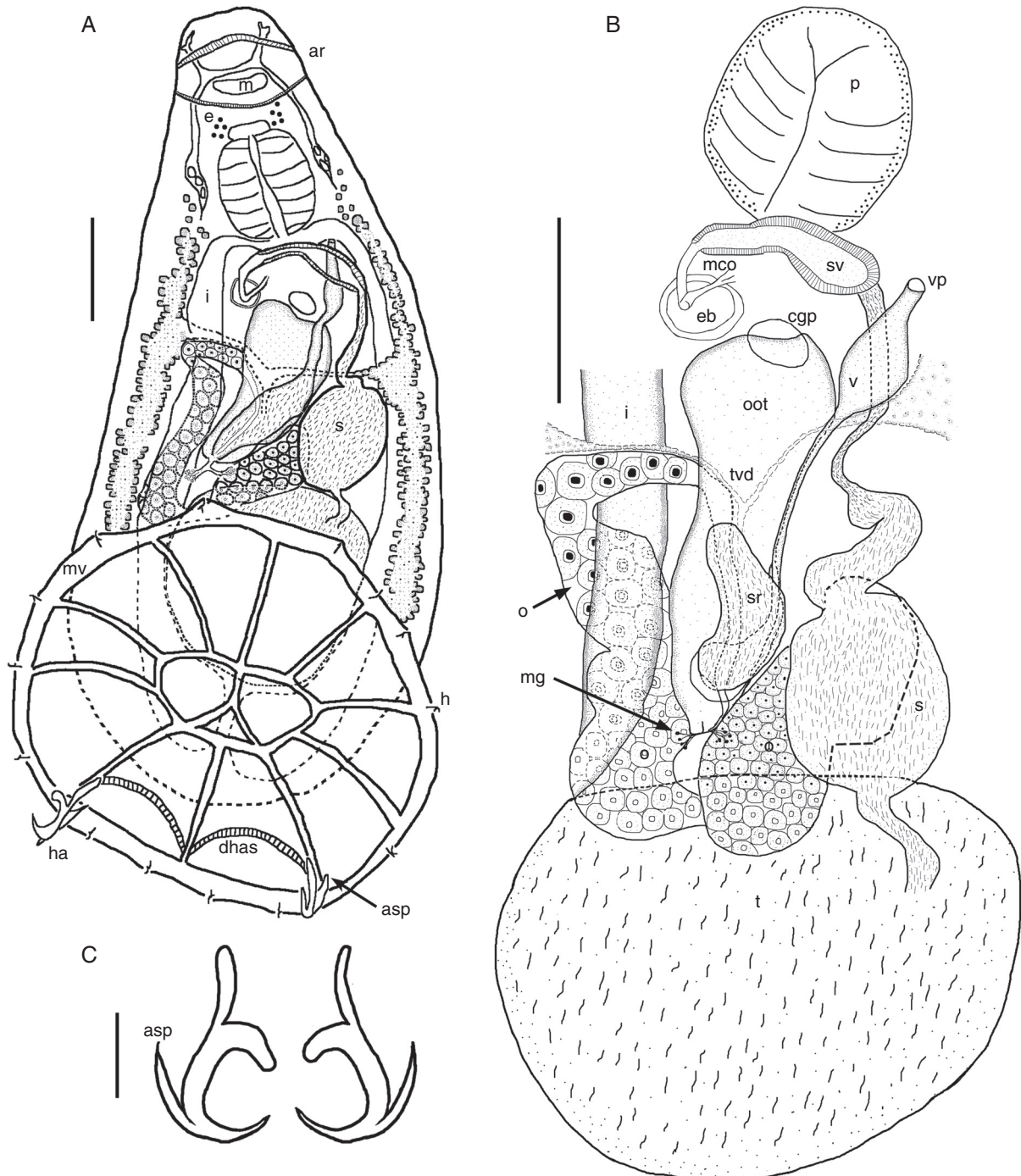
Figure 1. Line drawings of Denarycotyle gardneri n. gen., n. sp. (A) holotype, ventral view; (B) detailed view of male and female reproductive systems, ventral view (CNHE-9558); and (C) hamuli (r, right; l, left). Scale bars: A, B = 50 \mu m; C = 20 \mu m. Abbreviations: ar, anterior ridge; asp, accessory sclerotized piece; cgp, common gonopore; dhas, dorsal haptoral accessory structure; e, eyespots as dispersed pigment; eb, ejaculatory bulb; h, hooks; ha, hamulus; i, intestine; m, mouth; mco, male copulatory organ; mg, Mehlis' gland; mv, marginal valve; o, ovary; oot, oötype; p, pharynx; s, spherical reservoir; sr, seminal receptacle; sv, seminal vesicle; t, testis; tvd, transverse vitelline duct; v, vagina; vp, vaginal pore.

Ovary elongate, V-shaped, with lateral arm of "V" encircling right intestinal cecum dorsoventrally and narrowing to form oviduct. Longitudinal length of ovarian mass 94 (81–116, n=9 ) (Fig. 1B). Oviduct receives duct from seminal receptacle and common vitelline duct and joins oötype (Fig. 1B). Mehlis' gland not prominent (Fig. 1B). Oötype 115 (95–150, n=9 ) long and 40