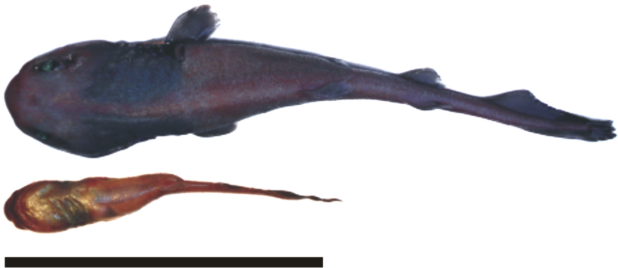
Figure 1. Specimens of the lollipop catshark Cephalurus cephalus caught in the Gulf of California (Talud X, St. 12). a), dorsal view of a female 221 mm TL. b), ventral view of a female neonate 107 mm TL. Bar= 100 mm.

The lollipop catsharks were caught at a depth range of 464 to 486 m and at a temperature of 9.4°C, and where hypoxic (0.14 ml/l) conditions prevailed. In the southeastern Gulf of California, epibenthic dissolved oxygen concentration is always <0.5ml/l and occasionally <0.1 ml/l, limiting the occurrence of macroinvertebrate species that cannot tolerate severe hypoxic conditions (Hendrickx 2001, 2003). However, for C. cephalus this does not repre-